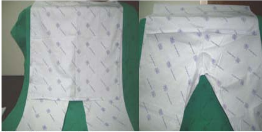
Fig.2 : Trousers model 2; Posterior view and during procedure view (from left to right)